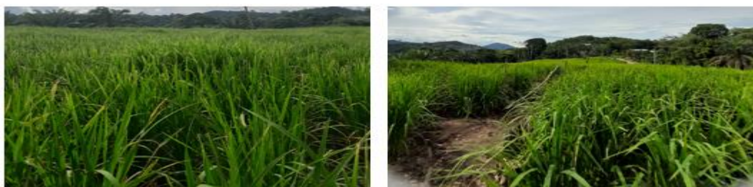
Figure 3. rice fields with rice plants in Tanjung Beringin Village

Based on the table above, Kecamatan Tabir Barat, Kabupaten Merangin, ranks 9th in terms of total production and productivity compared to the other 23 kecamatan in the region. This position indicates that although Kecamatan Tabir Barat has considerable potential in the agricultural sector and other production activities, there is still room for improvement and development in order to better compete with other kecamatan (Santoso et al., 2023). Farmers in Tanjung Beringin Village also practice a cropping system that depends on the season, so cropping and harvesting patterns are strongly influenced by the weather. Although crop yields contribute significantly to the village's economy, productivity often faces challenges such as declining soil fertility and climate fluctuations, here is a picture of the rice field area with rice plants in Tanjung Beringin Village: